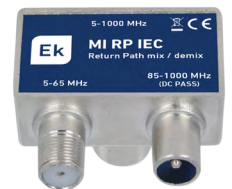
MI RP IEC