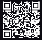
RUT241-eSIM 360° VIEW

The RUT241 eSIM™ is an industrial cellular router equipped with LTE Cat 4 and eSIM™ with SGP.22 pull-based consumer architecture. This compact eSIM™ router supports a physical SIM card, up to seven eSIM™ profiles, controlled via WebUI and RMS, and Trusted Platform Module (TPM) for enhanced security. The RUT241 eSIM™ router provides uninterrupted connectivity with automatic WAN failover and two Ethernet ports, making it perfect for your M2M and IoT solutions.