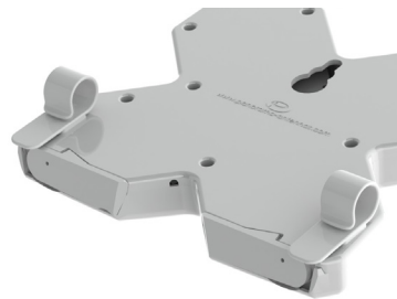
Figure 3 - Installing suction cups