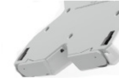
Figure 1 - Fold out desk stand feet