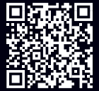
RUTM51 360° VIEW

The RUTM51 is a budget-friendly dual-SIM, multi-network industrial 5G router delivering connectivity for data-heavy applications. With five Gigabit Ethernet ports, dual-band Wi-Fi, and auto-failover, it ensures seamless, reliable performance. Backward compatibility with 4G Cat 12 and a versatile range of interfaces make the RUTM51 5G router a smart, future-proof choice for businesses seeking high-speed connectivity at a lower cost.