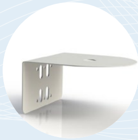
710452 – AllDisc bracket