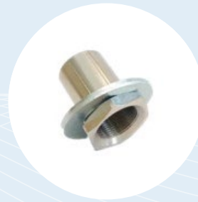
710206 – Extension nut to be used on AllDisc with long screw enabling installation thickness 25-50mm