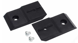
MA-3 Router surface mounting kit

Mounting: flat surface Material: ABS + PC plastic Weight: 2x5 g Dimensions: mm 25x48x7,5