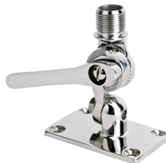
PA-30 Four way SS ratchet mount

Mounting: 1" x 14 thread Material: Electropolished s. steel Weight: 680 g Dimensions: mm 90x60x110