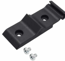
MA-2 Router compact DIN rail kit

Mounting: 35 mm DIN rail Material: ABS + PC plastic Weight: 6,5 g Dimensions: mm 70x25x14,5