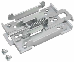
MA-1 Router DIN rail kit

Mounting: 35 mm DIN rail Material: Low carbon steel Weight: 57 g Dimensions: mm 82x46x20