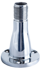
PA-40 Stainless steel marine mount

Mounting: 1" x 14 thread Material: Electropolished s. steel Weight: 280 g Dimensions: mm 102x70.5(Ø)